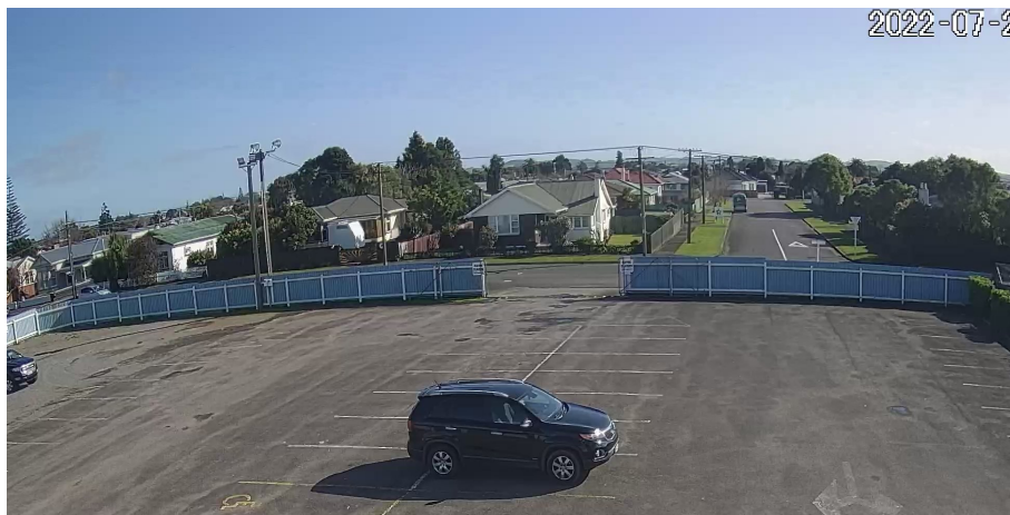
Seddon Street Entrance/Exit

Entry/exit will be through Seddon Street only on Friday & Saturday evenings.