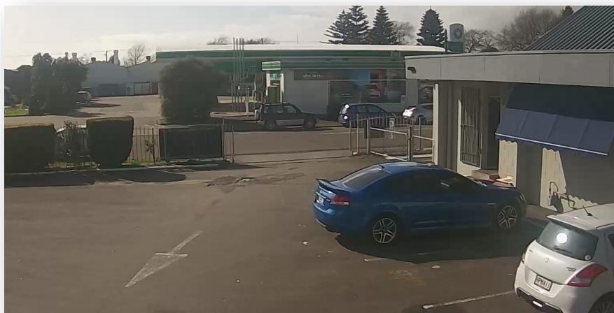
Ward Street Entrance/Exit

We apologise if this closure causes any inconvenience, but it is for our staff and members safety, which is paramount.