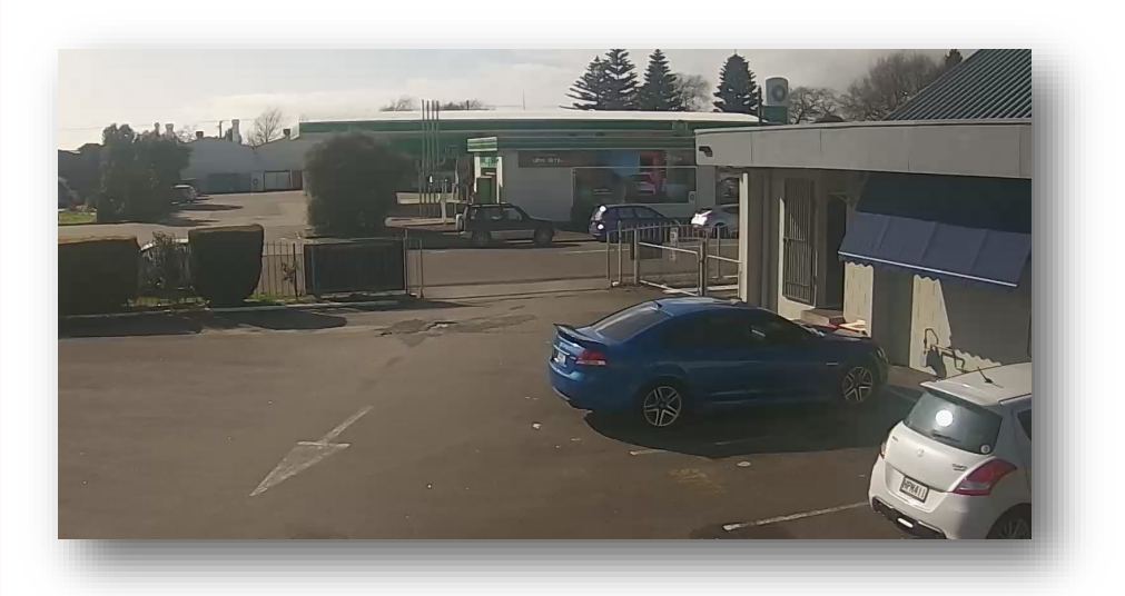
Ward Street Entrance/Exit

We apologise if this closure causes any inconvenience, but it is for our staff and members safety, which is paramount.